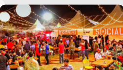
Food & Drinks