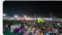
Live Performances by famous Kolkata artists