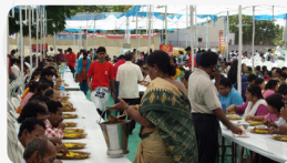
Largest Community Gathering for Bhog Prasad